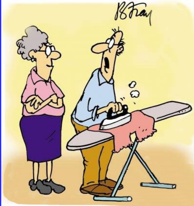
"THIS ISN'T WHAT I HAD IN MIND WHEN I SAID I WANTED TO BE IRON MAN!"